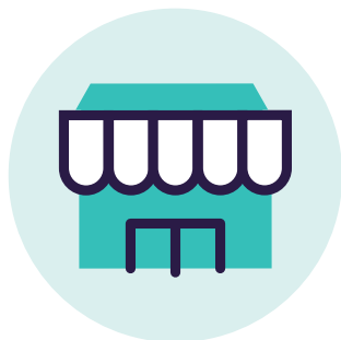
Mixed findings on property crime, loitering and other public nuisances