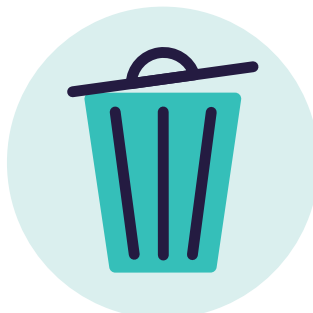
Fewer publicly discarded needles