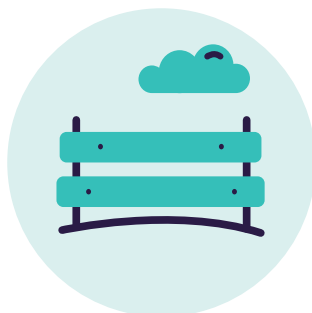
Less public drug use