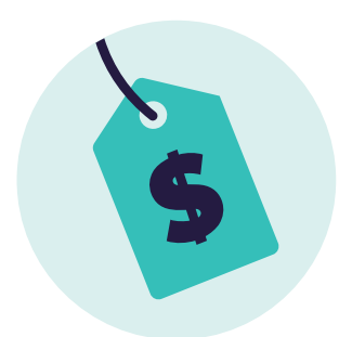
No verified changes in drug trafficking